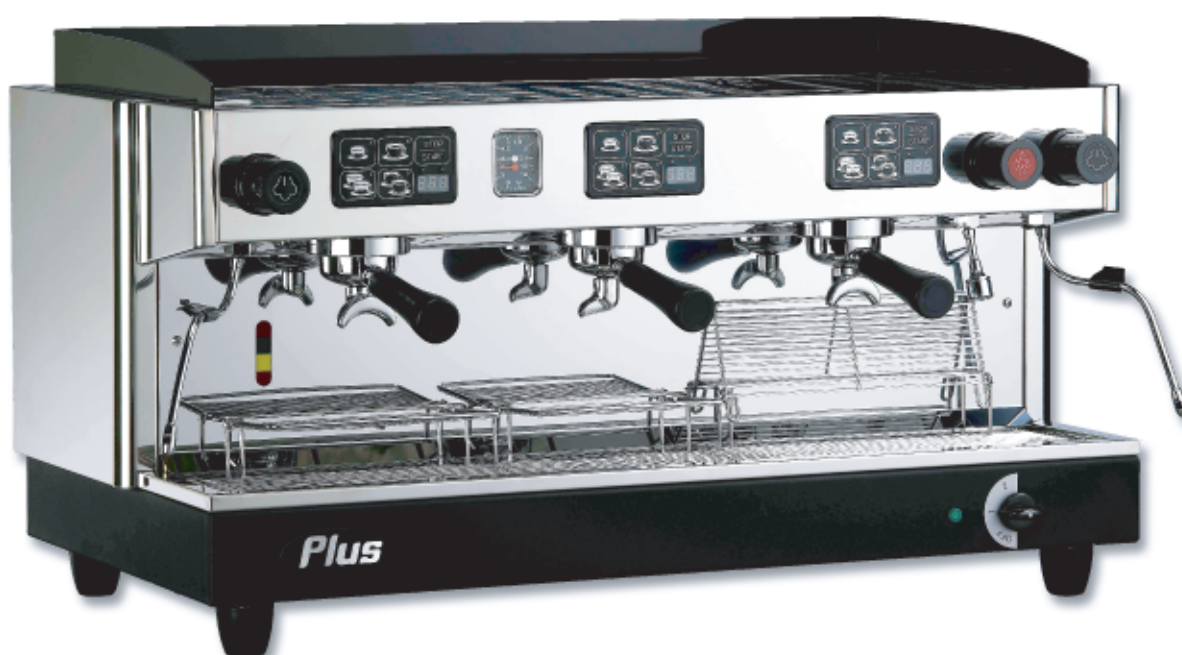
Plus model 333 (3 group)